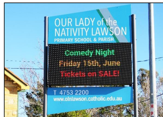
Our Lady of the Nativity Lawson olin@parra.catholic.nsw.edu.au 02 4753 2200